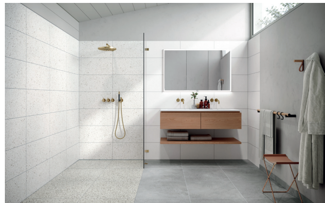
TRIO makes the classic Terrazzo available as a 9 mm thin floor tile and 6 mm wall tile for modern demands. The Terrazzo design mixes up the simple cement stone look of the basic tiles with lively contrasts or blends in close to the colour.