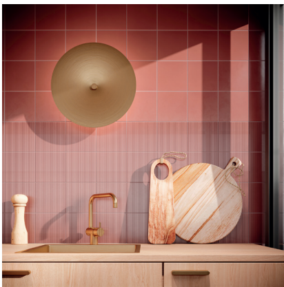
The colour decor of the TRIO triad is available in two variants: COLOR with a velvety matt plain glaze and LINES, high-gloss and with a grooved relief that can be experienced visually and haptically. Can be laid together or separately on small or large surfaces.

press contact: Gabriele Busse | gabriele.busse@deutsche-steinzeug.de | +49 (0)228 391 1104 | www.agrob-buchtal.de