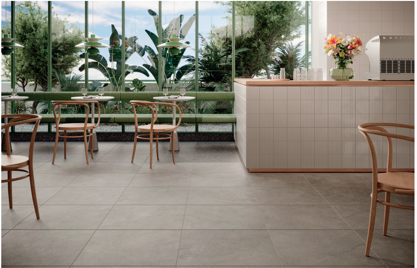
Wonderfully relaxed bistro atmosphere with TRIO. Here with the floor tile in cement stone look 60x60 in „mud grey“. The counter is lined in the Lines 15x15 decor in the „platinum“ colour scheme.

press contact: Gabriele Busse | gabriele.busse@deutsche-steinzeug.de | +49 (0)228 391 1104 | www.agrob-buchtal.de